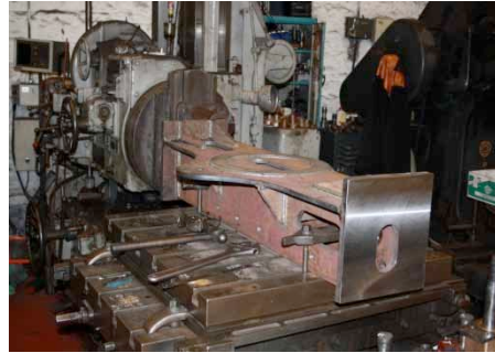
Photo. Machining of brake cylinder support Stretcher.